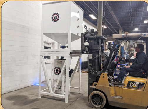
5) Hopper is placed back into base.