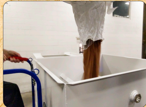
4) Abrasive is released into hopper.