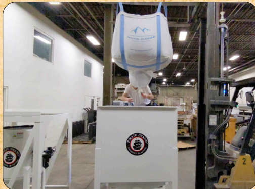
3) Bulk bag is positioned above hopper and prepped for abrasive release.