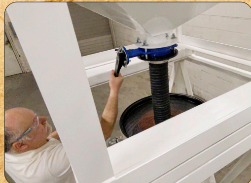
6) Butterfly valve is opened, loading abrasive into vessel.