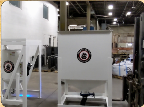
1) Hopper is placed on the ground via forklift.